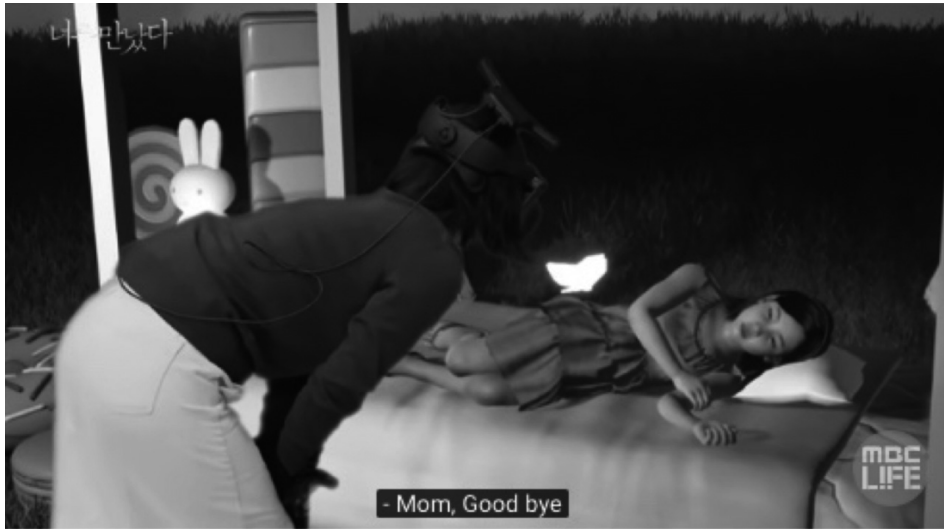
Screenshot from I Met You (Munhwa Broadcasting Corporation, Korea, 2019)

meaningful sense. Later, we see the mother's hands passing through the child's face as she tries to touch her, and later still the mother appears to be placing virtual candles on the birthday cake as if in a gaming environment. The uncanny valley is a gaping chasm here, and I have to wonder, despite the tacit acknowledgment of cultural differences in the memorialising of the dead, if this is truly therapeutic for those involved. 61)